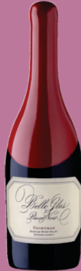
Belle Glos Pinot Noir Dairyman Only $42.00 Reg. $45.00