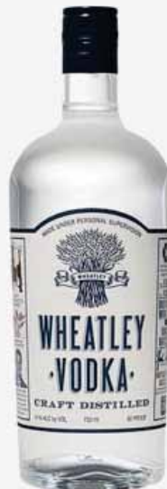
Wheatley Vodka Buffalo Trace Distillery Only $17.97 Reg. $19.00