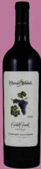
Chateau St Michelle Cold Creek Cabernet Only $23.97 Reg. $29.99