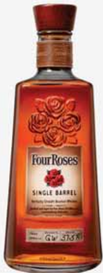
Four Roses Single Barrel Bourbon Only $44.97 Reg. $48.99