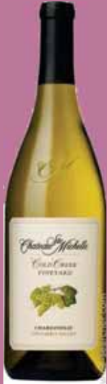
Chateau St Michelle Cold Creek Chardonnay Only $19.97 Reg. $22.99