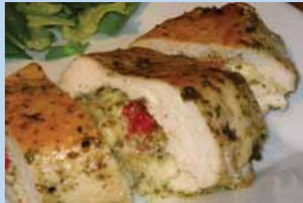
Stuffed With Sage, Brie & Arugula

Antonio's Boneless Chicken Breast Stuffed $8.99 Each