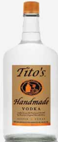
Tito's Vodka 1.75 liters Only $27.97 Reg, $29.99