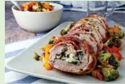
Stuffed With Sundried Tomato, Rosemary And Feta Wrapped in Prosciutto

Antonio's Stuffed Pork Tenderloin $8.99 Each