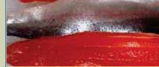
Fresh Ruby Red Trout

March 20 th “National Ravioli Day” Antonio's Boil in Bag Ravioli Reg. $10.99 Only $8.49 Spinach & Cheese w/Amatriciana Short Rib w/Cheddar Cream Sauce Three Cheese w/Vodka or Pomodoro Sauce